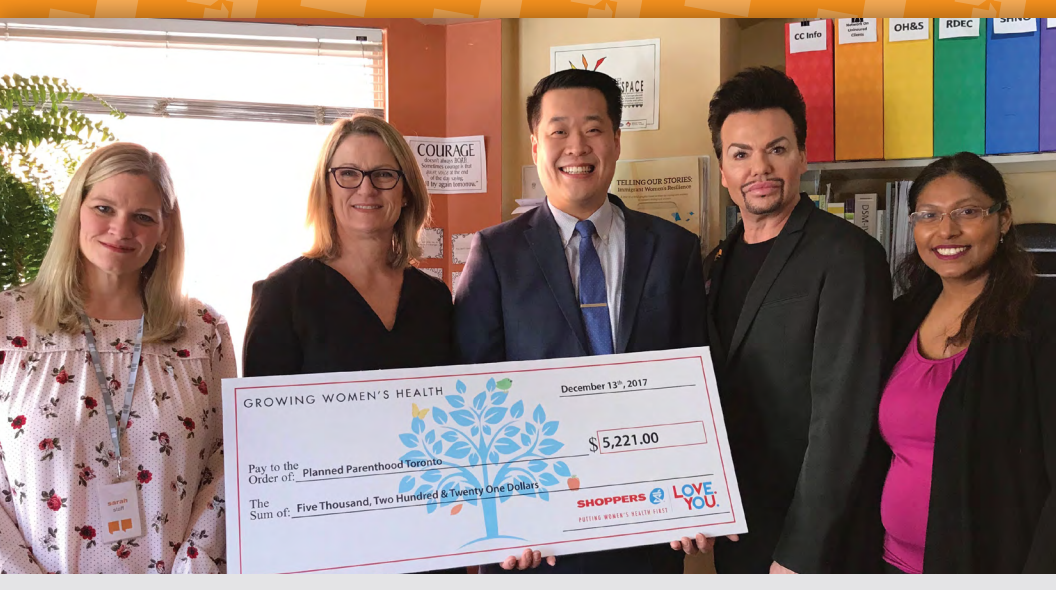
Shoppers Drug Mart staff presenting PPT with cheque that we designated to a compassionate birth control fund