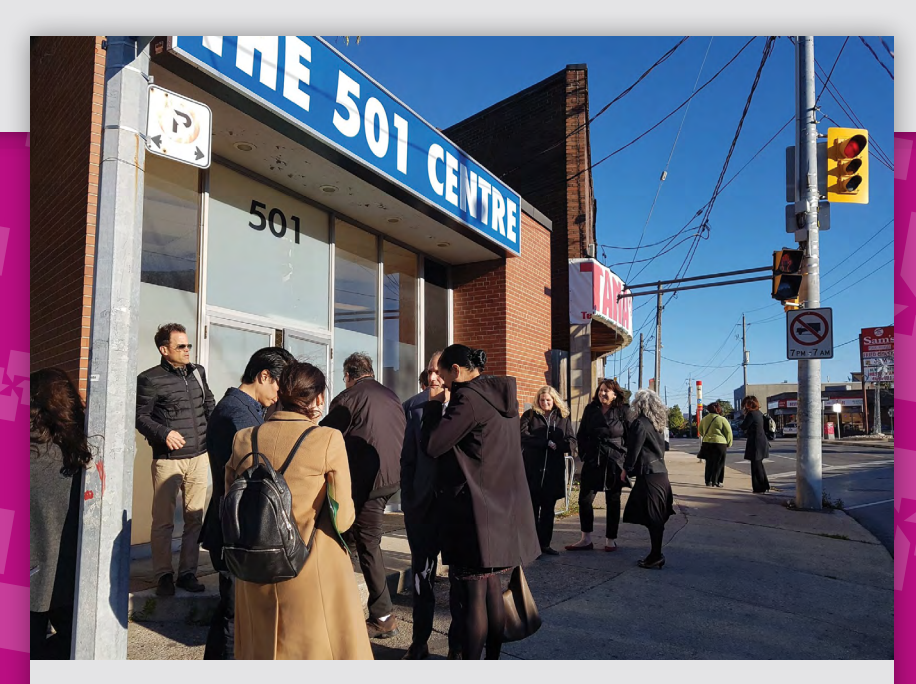
Future site of EdgeOV in the Oakwood-Vaughan neighbourhood