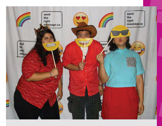
Youth hosts at the Send the Right Message campaign launch

The LGBTQ Youth Initiative created a powerful social marketing campaign called "Send the Right Message" which challenges homophobia, biphobia and transphobia among youth. Additionally, two new programs were piloted: an employment skills series called